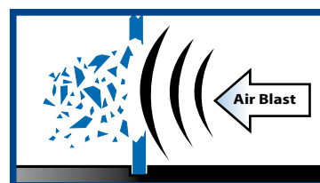
▪ Unprotected window pane